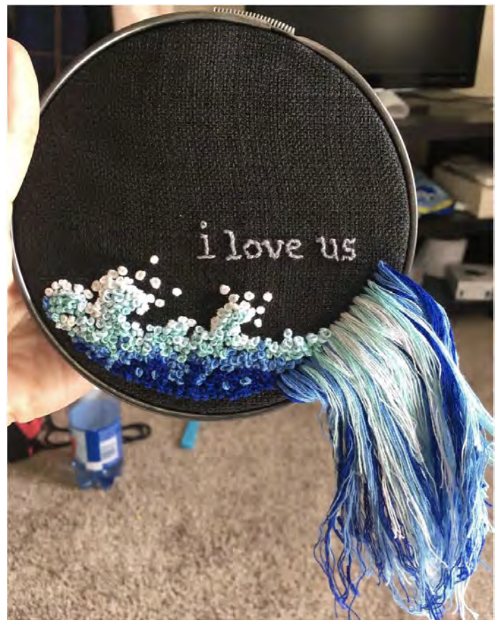
ORIGINAL PIECE OF ART FROM PARTICIPANT, AGE 33 WINNIPEG, MB