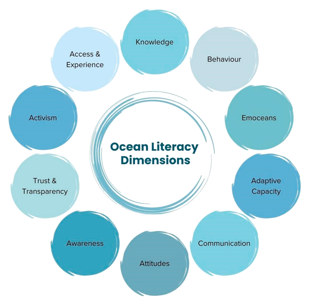
Fig. 1. Evolving Dimensions of Ocean Literacy. (Adapted from [23]).

to remedy these challenges, a global initiative<sup>2</sup> was launched in July 2021 with the aim of co-developing an ocean literacy research program for the Ocean Decade and beyond. The initiative supported a research agenda and direction by creating an Ocean Literacy Research Community (OLRC) through an emergent series of workshops and thematic surveys (see [24]) to: